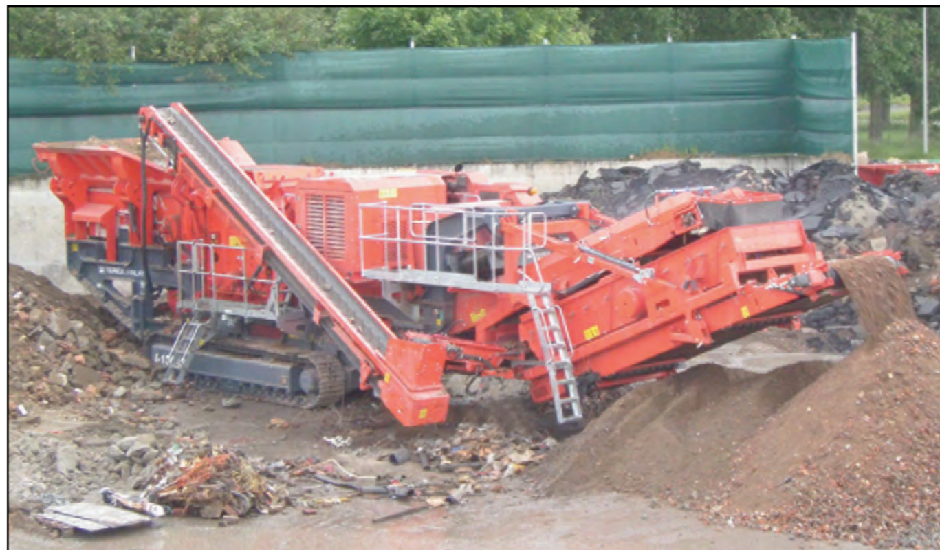
Machine Weight: 59,000Kg (130,090lbs)* *Without By-pass and magnet options