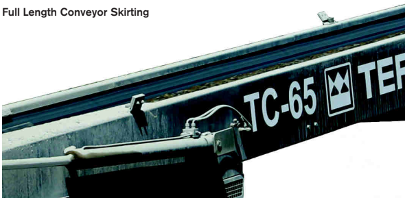
Full Length Conveyor Skirting