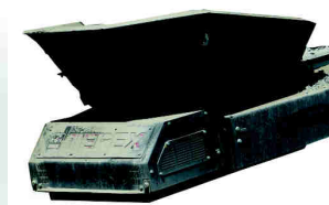
Feed Boot Extension