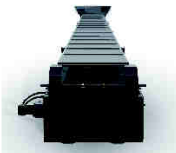
Head Drum Guards and Dust Covers