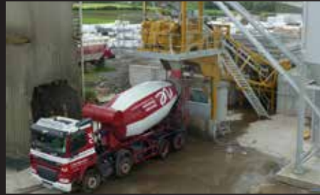
Readymix concrete Northern Ireland