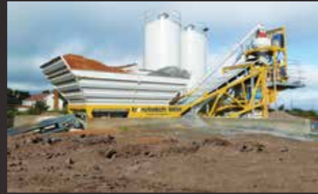
Readymix concrete Ireland

WE ARE PROUD TO BE SUPPLIERS TO THE FOLLOWING LEADING GLOBAL COMPANIES:-