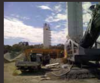
Road project Australia