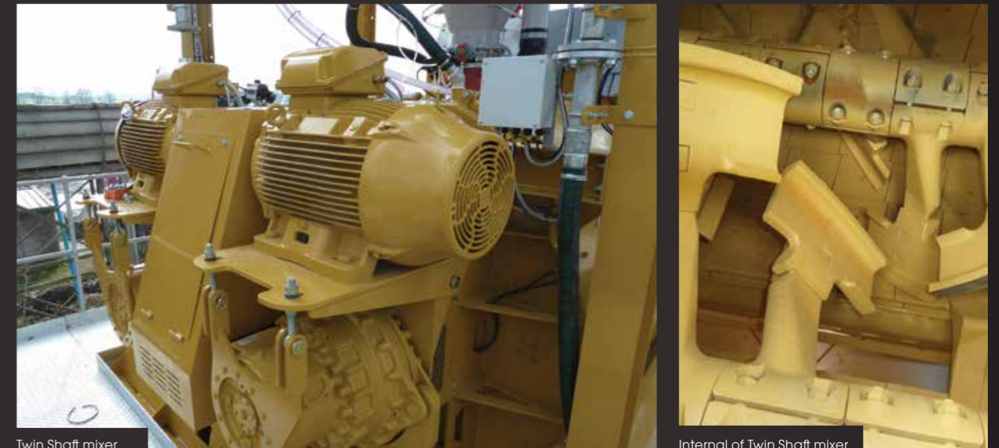
Twin Shaft mixer