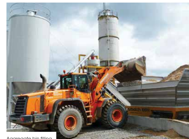
Aggregate bin filling