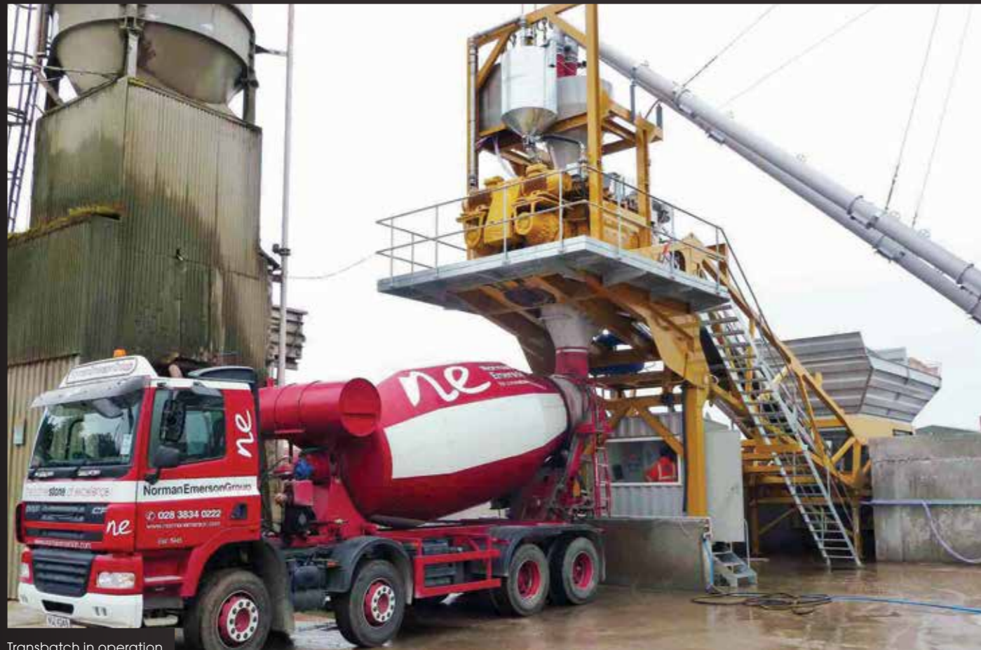
Transbatch in operation