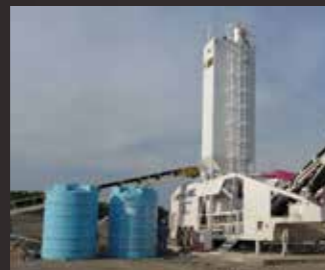
Dam building Mexico