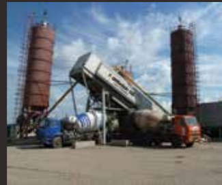
Concrete road building and readymix Russia