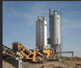
Soil stabilisation California