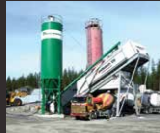
Wind farm project Sweden