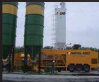
Airport runway Russia