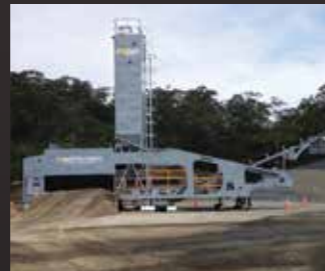
Road base Australia