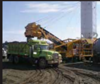
RCC South Carolina