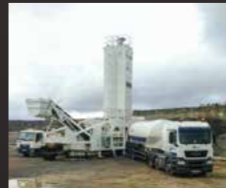
RCC Paving UK