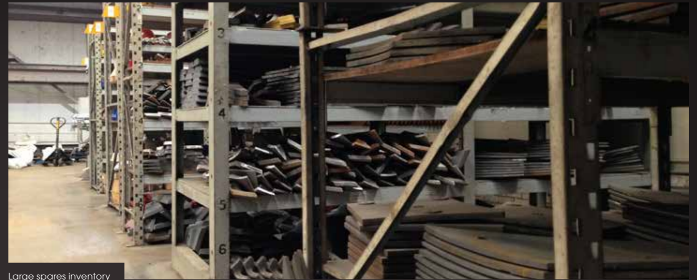
Large spares inventory