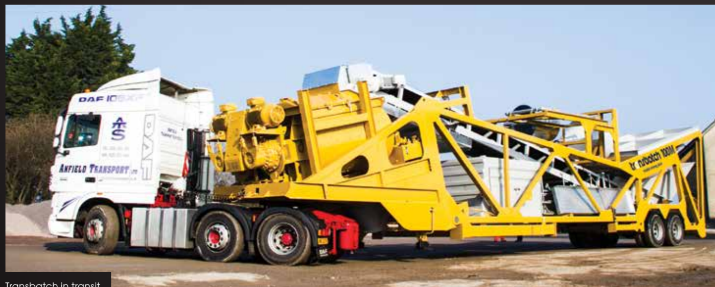
Transbatch in transit