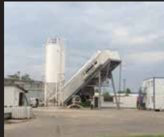
Airport project Latvia