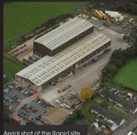
Aerial shot of the Rapid site