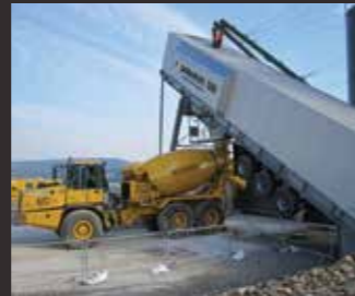
Wind farm project Scotland