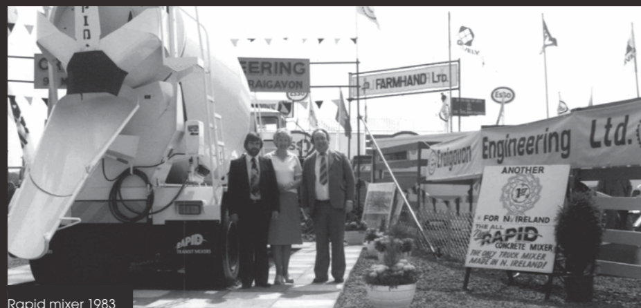
Rapid mixer 1983